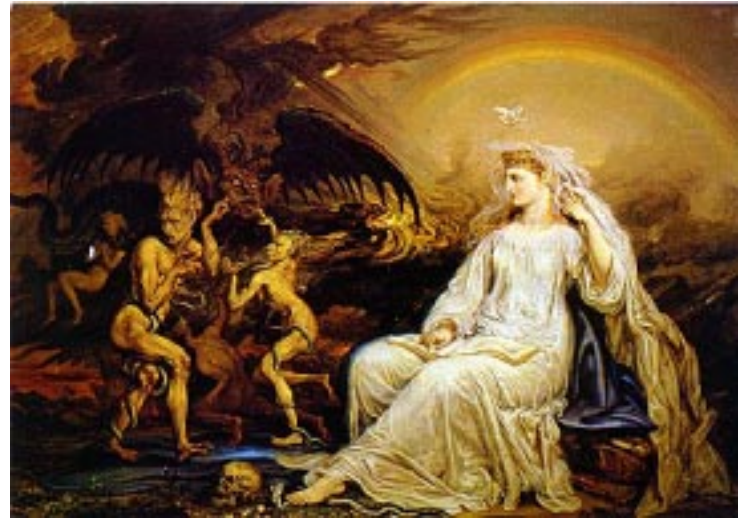
James Ward (1769 - 1859) Miranda and Caliban.

Now my charms are all o'erthrown, And what strength I have's mine own, Which is most faint: now, 'tis true, I must be here confined by you, Or sent to Naples. Let me not, Since I have my dukedom got And pardon'd the deceiver, dwell In this bare island by your spell; But release me from my bands With the help of your good hands: Gentle breath of yours my sails Must fill, or else my project fails, Which was to please. Now I want Spirits to enforce, art to enchant, And my ending is despair, Unless I be relieved by prayer, Which pierces so that it assaults Mercy itself and frees all faults. As you from crimes would pardon'd be, Let your indulgence set me free.